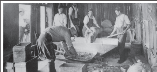
Former WWI diggers working at Grantham Poultry Research Station