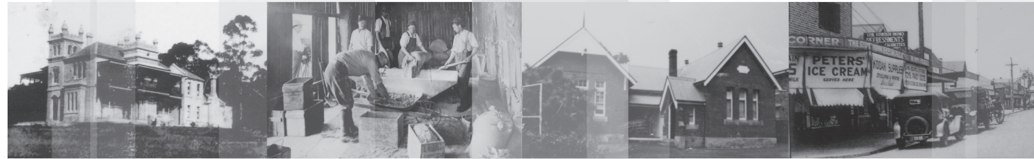
Above: 'The Turrets', Men working in the Grantham Poultry Research Station Front: Blacktown Public School, Scene from Main Street Blacktown

Blacktown and District Historical Society was founded in 1976, to ensure that the history of the Blacktown area would be collected and conserved for all time by tapping into documents and people's memories.